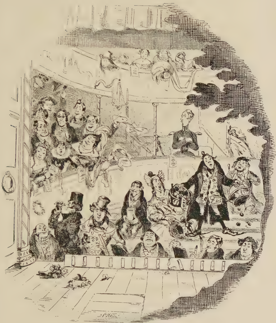
THE GREAT BESPEAK FOR MISS SNEVELLICCI.